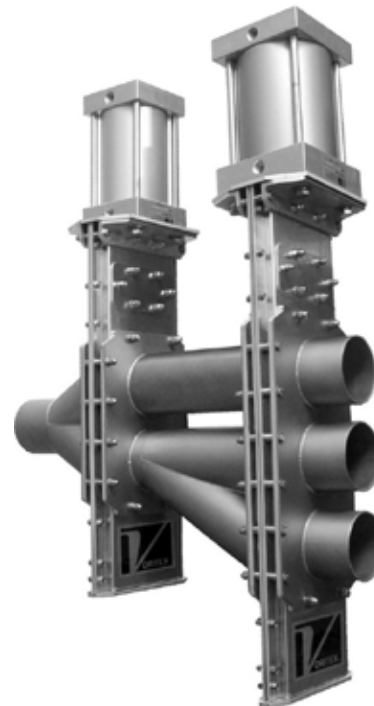
Patent No. 7464913